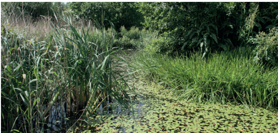
'Computerised' reed beds at Heathrow, part of the airport's environmental commitment

"European airspace is in the process of being modernised and this will mean a change in flight patterns. The local community, as well as the political